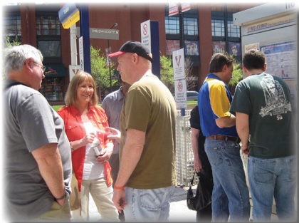
Day 2: The group heads out for THE FREE St. Louis Zoo!